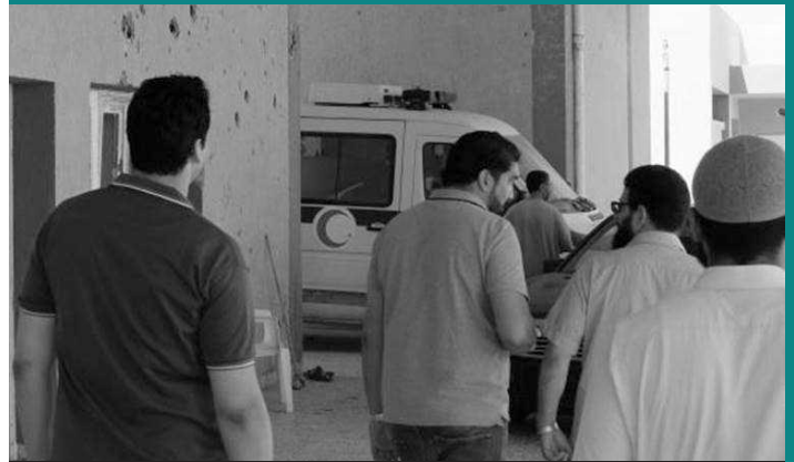
Ubari, 2016: PCi project team monitoring Stabilization Facility projects

In this way, the Social Peace Partnership has contributed to the sustainability of both the Stabilization Facility programme and its projects through providing a forum for the Stabilization Facility to meet and interact with communities and local authorities to support conflict sensitive project implementation.