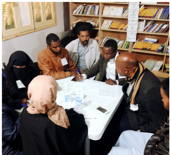
TOP: Ubari, February 2018, PCi delivers training on conflict management skills to the Social Peace Partnership; Ubari, October 2017, PCi implements transformational leadership training; BOTTOM: Ubari, April 2018 PCi provides mentoring on communication skills to the Social Peace Partnership