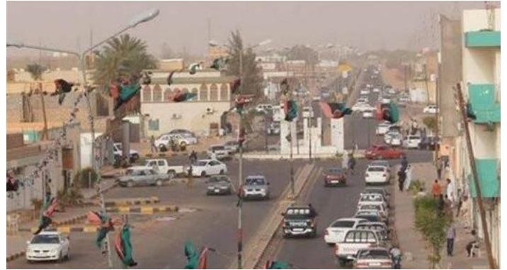
Ubari, Libya

Ubari is an oasis town situated in a hot area of southwest Libya, inhabited by an estimated 30,000 people. Following the 2011 revolution, the intricately structured relationships of patronage and power that had kept the area firmly under central government control, came to an end. The Tebu, Arab and Tuareg communities became involved in violent conflict, creating a volatile environment, which has devastated the local economy, damaged local infrastructure and led to a sharp decline in the provision of local services. At the local level, the key drivers of conflict include resources and ethnicity. Several ceasefires and peace agreements were brokered but proved too fragile to contain tensions. Since 2016, however, a ceasefire has held in Ubari, creating a more stable environment.