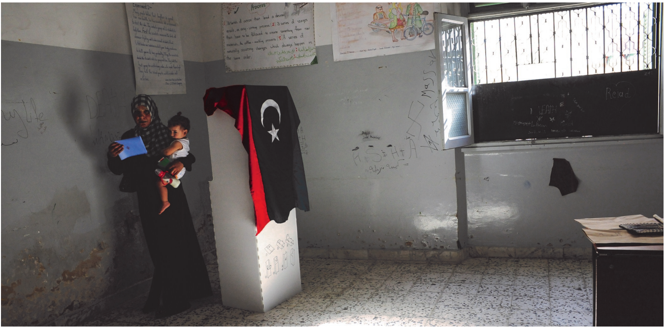
WOMAN VOTING IN TRIPOLI, JULY 2012.